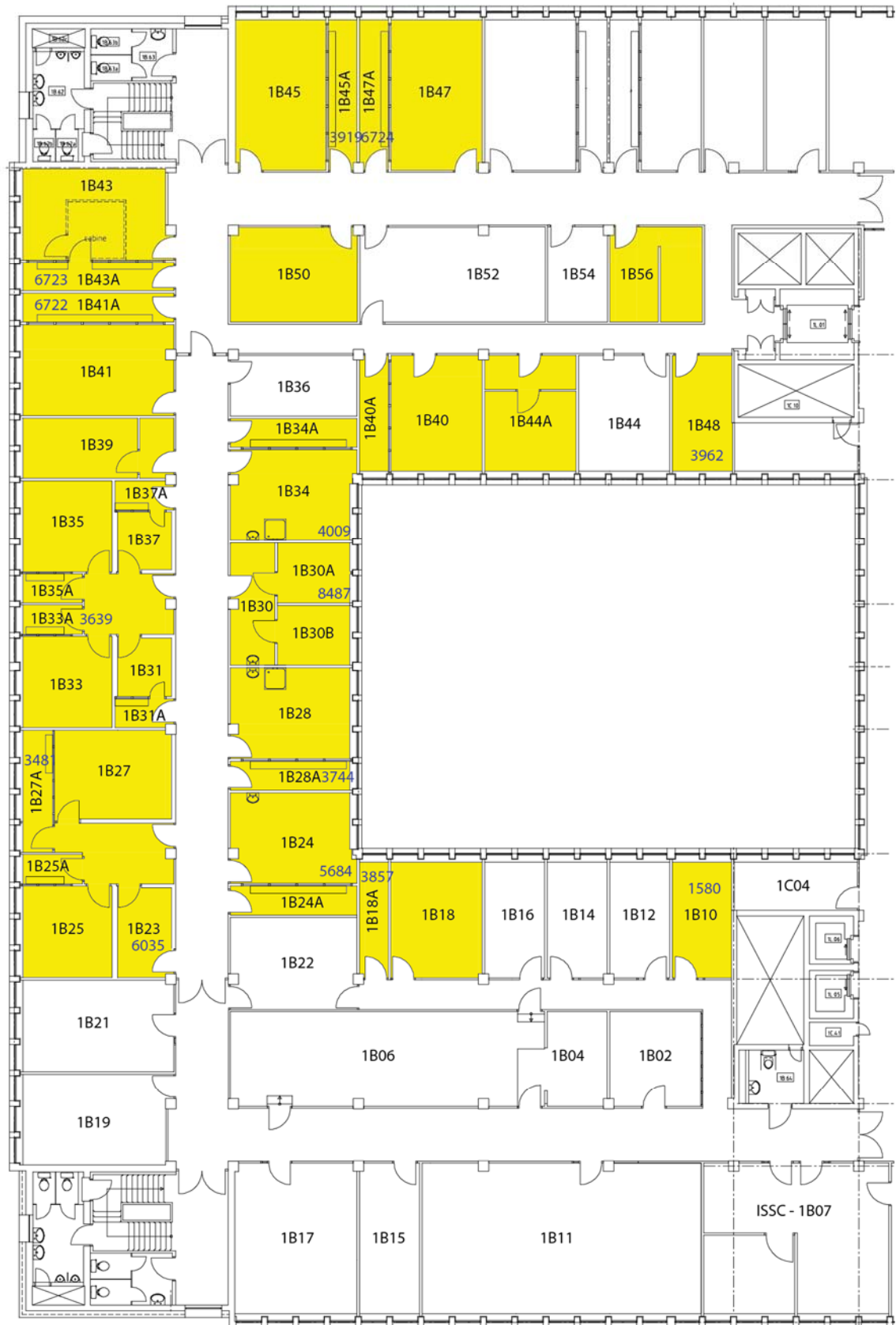
Figure 1: 1st floor