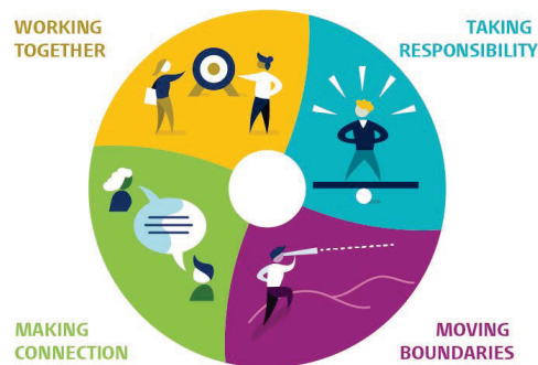
Leadership competencies of Leiden University